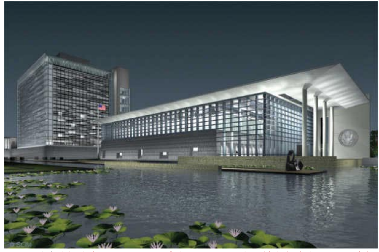
Rev 17:1-3, "And there came one of the seven angels which had the seven vials, and talked with me, saying unto me, Come hither; I will shew unto thee the judgment of the great whore that sitteth upon many waters: 2 With whom the kings of the earth have committed fornication, and the inhabitants of the earth have been made drunk with the wine of her fornication. 3 So he carried me away in the spirit into the wilderness: and I saw a woman sit upon a scarlet coloured beast , full of names of blasphemy, having seven heads and ten horns ." KJV