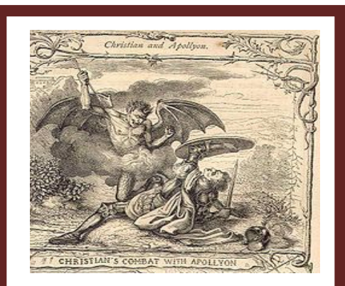
Apollyon (top) battling Christian in <u>John Bunyan</u>'s <u>The Pilgrim's</u> <u>Progress</u>.